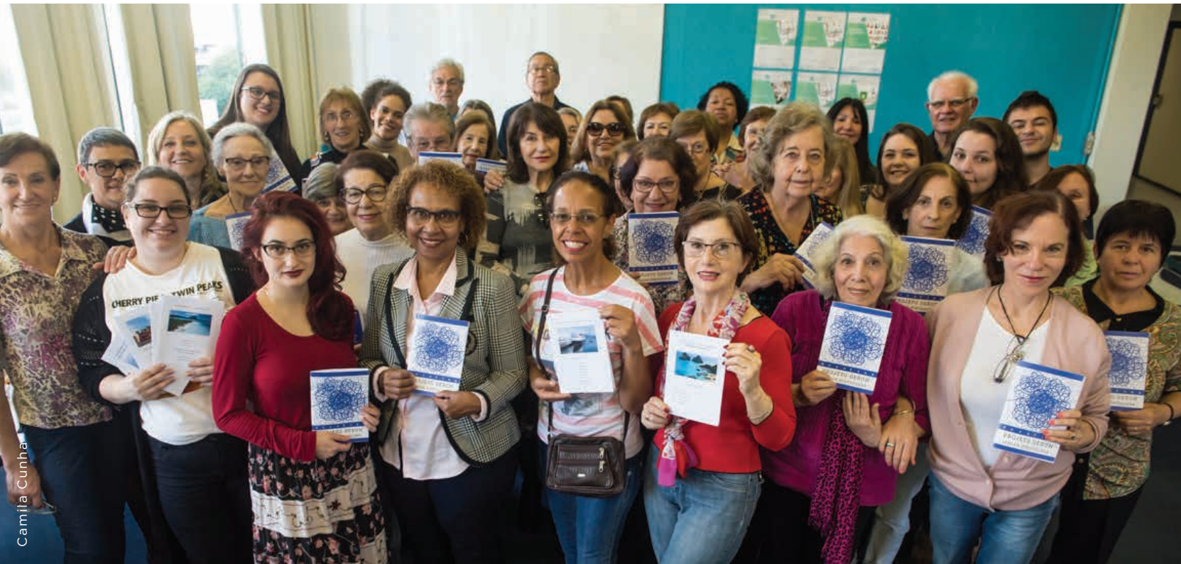
Participants of Projeto Geron , involving people aged 60 or older, have autographed two books produced in the classes taught by students of PET Letras, embraced by the School of Humanities , in the first semester of 2017.